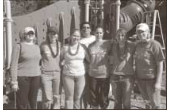
The JLP KaBOOM! committee celebrates the completion of its second playground, located on Pittsburgh's North Side.

KaBOOM! is a national non-profit organization that envisions a great place to play within walking distance of