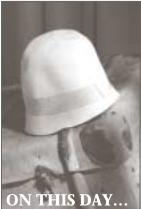
ON THIS DAY...

E mbracing a historic year, the Junior League of Pittsburgh (JLP) celebrated 85 years of tradition, voluntarism and community involvement. The League marked the momentous occasion by honoring 25 outstanding women at a luncheon at the Churchill Valley Country Club on October 14, 2007.