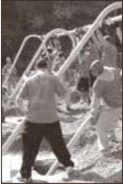
Volunteers complete installation of a swing set.

The Junior League of Pittsburgh chose KaBOOM! as its signature project and committed to building three play spaces over three years.