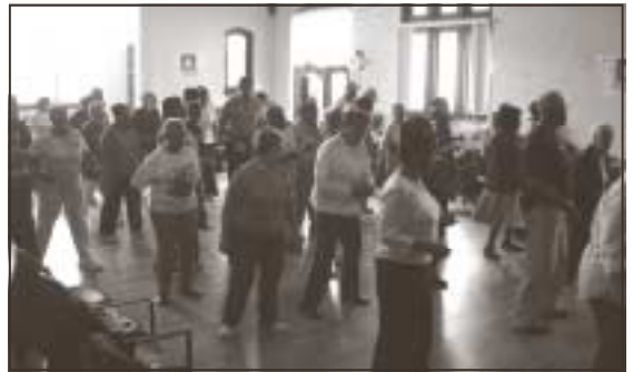
Members of the Vintage Senior Community Center participate in "A Soul Line Dancing Celebration" hosted by the JLP Provisional class.

such classics as "The Electric Slide" and the "Steel City Stomp." In addition to giving the seniors a novel approach to maintaining an active and healthy lifestyle, the participants enjoyed refreshments and door prizes. One dancer was crowned the "Soul Person of the Day" and received complimentary dance classes of their choosing, courtesy of Point Park University.